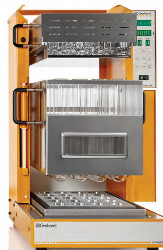
For example KBL 20S TZ