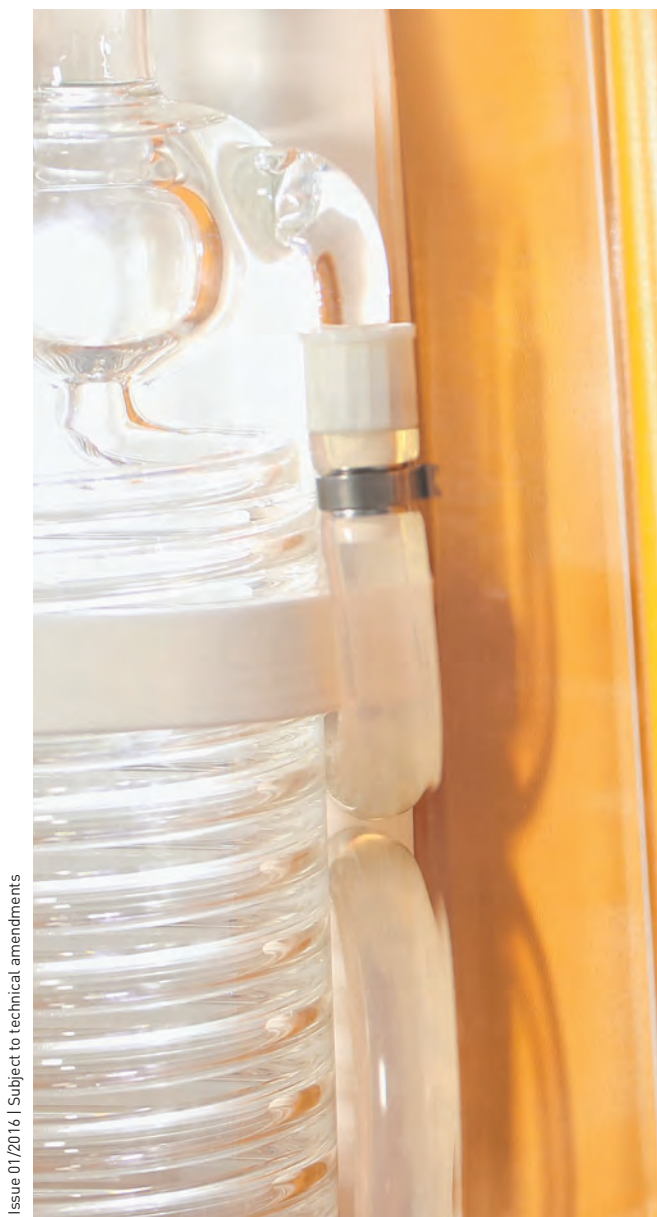
Issue 01/2016 | Subject to technical amendments