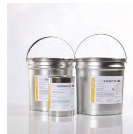
KJELCAT catalysts and anti-foaming tablets