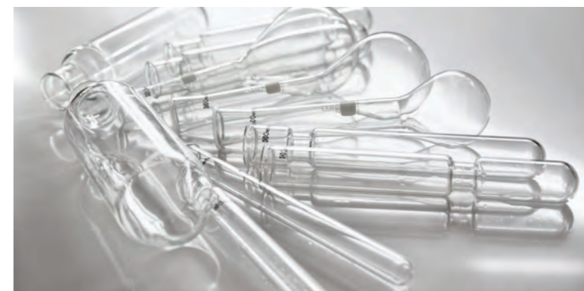
Digestion tubes and Kjeldahl flasks

“The variety of our accessories range is unsurpassed. We can satisfy any requirement.”