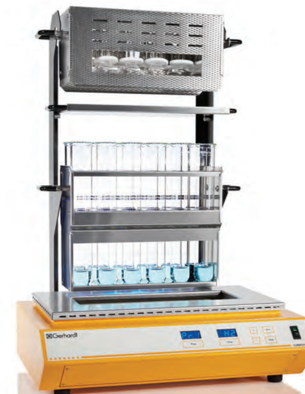
For example TT 125